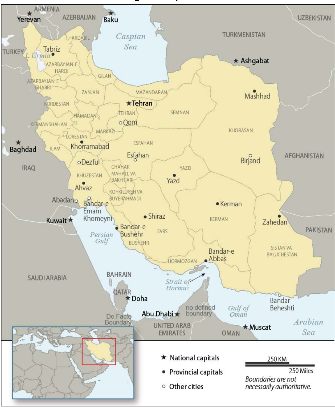
Figure 2. Map of Iran